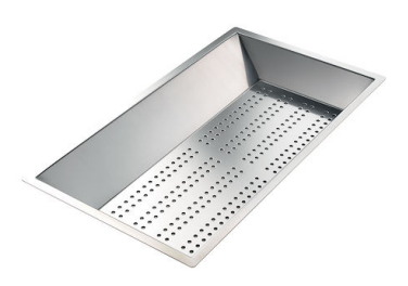
Stainless steel perforated tray

* only in combination with the accessory 8644 101